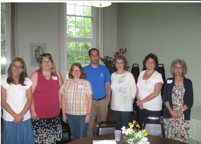
Individually Directed Retreatants at JRH for a July Weekend Retreat.